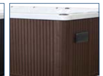
*Espresso (Upcharge may apply)